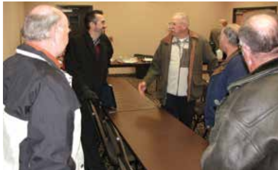
One-on-one discussions like this are an excellent time to express the concerns of the co-op and can go a long way toward influencing legislators when it comes time for them to vote.

Legislators also were asked to support joint resolutions that call on the Federal Emergency Management Agency to resolve the issues involving required testing on power lines and the Environmental Protection Agency's efforts to restrict carbon emissions